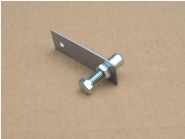
Setup Of Nutsert