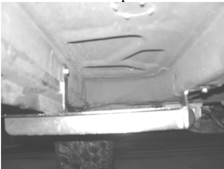
Front mounting bracket