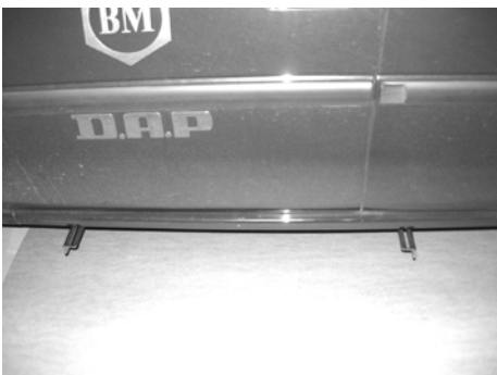
Brackets shown on vehicle without step.