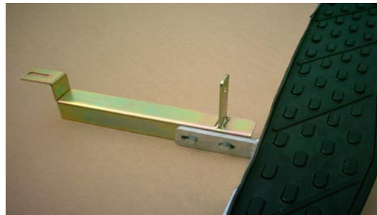
Bracket shown on front of step.

6 Finally ensure all nuts and bolts are tight and the step feels secure.